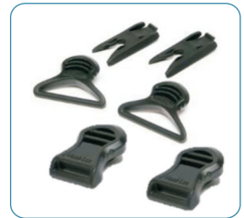
Goggle Swivel Clips