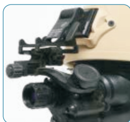
US Army Mount