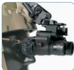
Wilcox G09 Mount Arm