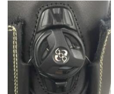
BOA® Closing system SHIELDED