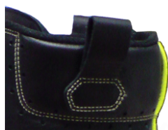
2 Wider pull straps Breathable Upper