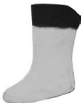
Waterproof Bootie Gore-Tex® Lining