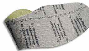
High tenacity polyester (HTP) Insole * Similar to Kevlar®