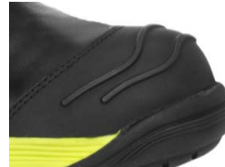
New improved rubber external protection