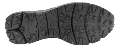
Vibram sole with MEGAGRIP compound