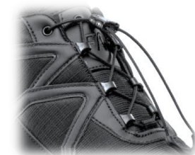
Non-metallic reinforced hooks – quick adjustment