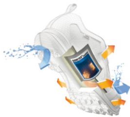
Breathing Sole GTX SURROUND

Complies with EN ISO 20347:2012 OB + SRA + HRO + E + WRU + WR