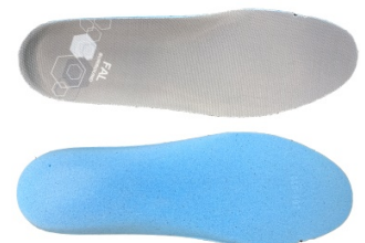
Removable + Breathable Insole.