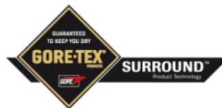
Waterproof + breathable 360° bootie membrane