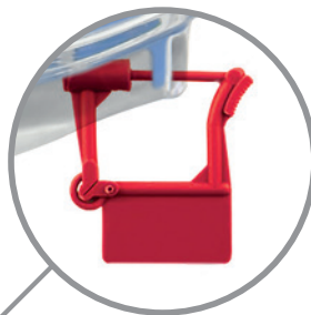
Break seal component for added security